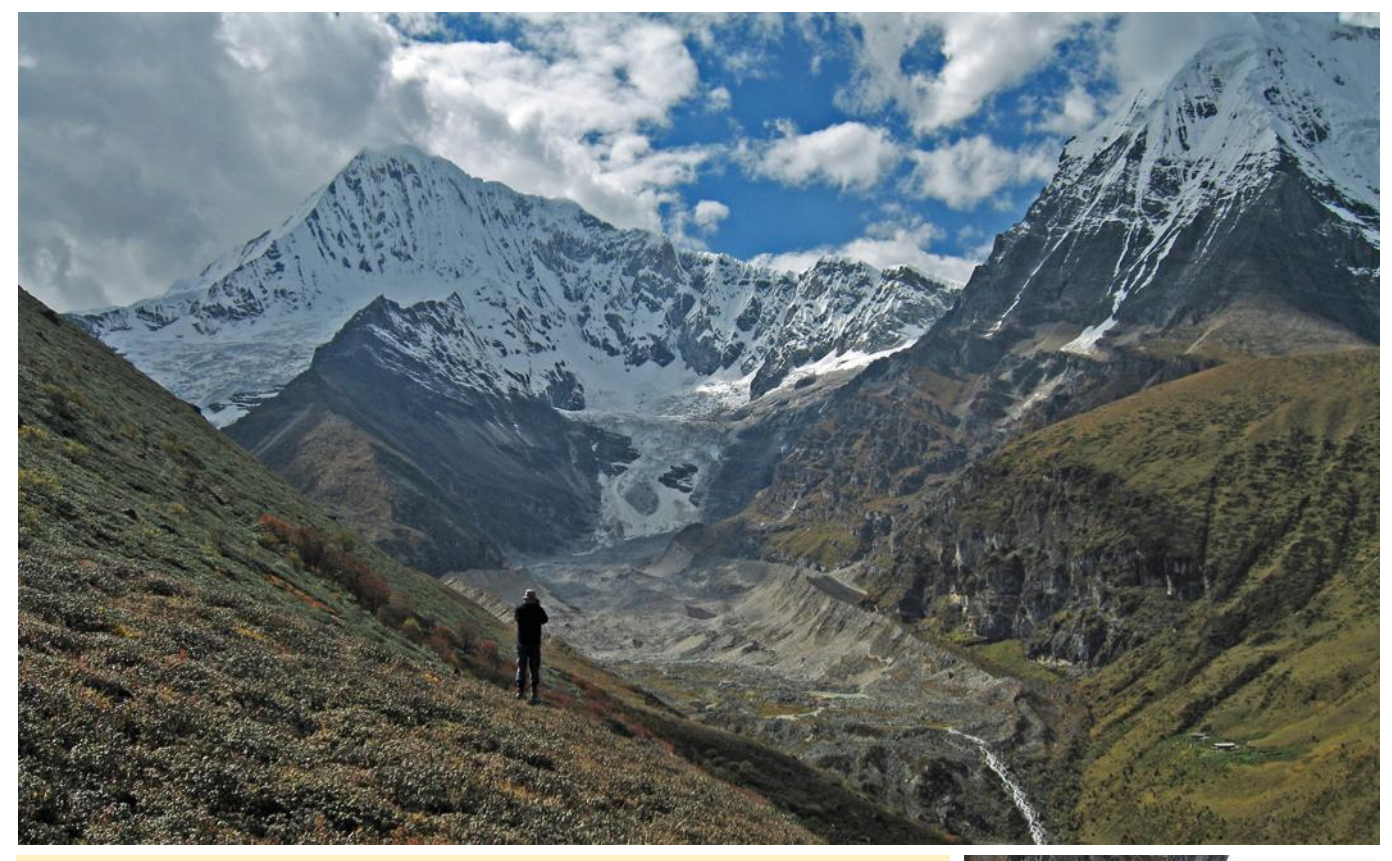
Group departures See overleaf for departure dates

One of the finest treks in the Himalaya: remoteness, fantastic mountains and fascinating villages.